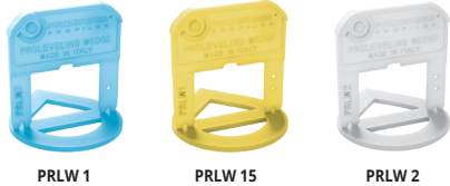
Levelers H 12-20 mm